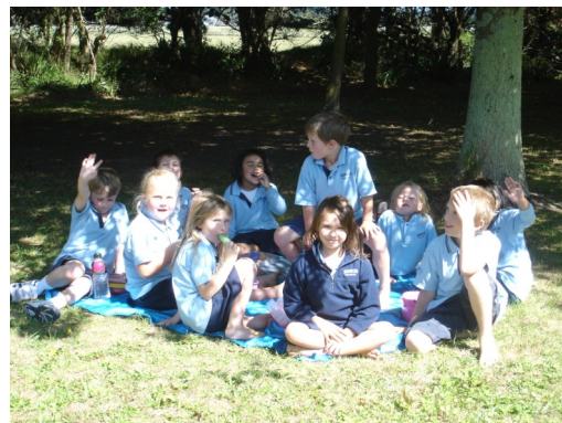
Room 1 enjoying the last of the amazing spring weather